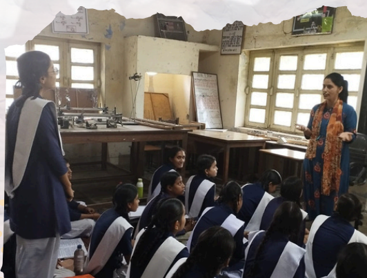
AUGIC Halduchaur NTL