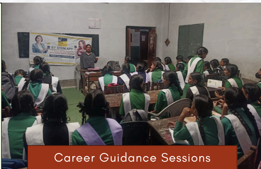
Career Guidance Sessions

These session involve talks by professionals in STEM fields, workshops on career paths, or discussions about skills needed for STEM careers, aiming to inspire and guide participants towards future opportunities.