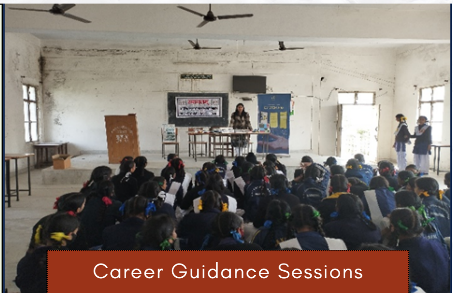
Career Guidance Sessions

These session involve talks by professionals in STEM fields, workshops on career paths, or discussions about skills needed for STEM careers, aiming to inspire and guide participants towards future opportunities.